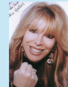
JACKIE KALLEN: Her life was the inspiration for the film film "Against the Ropes", starring Meg Ryan as Jackie, in which she had a brief speaking role as a reporter. She also worked as a consultant for Mark Burnett's reality TV Series, "The Contender". Kallen was raised in a middle-class Jewish Family in Detroit. After 33 years in the boxing world as a publicist and then manager, Jackie Kallen has been dubbed "The First Lady of Boxing".